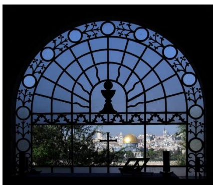
Church of Dominus Flevit , left, is particularly evocative.

We have another reminder of Jesus as prophet (prophet Jeremiah announced Lord's weeping over his people, and used his own tears as acted prophecy). Stone language is important here: